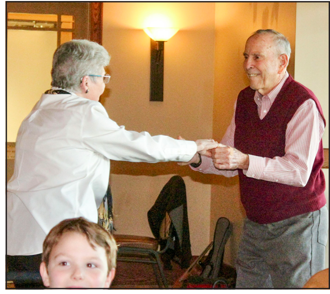
Several couples had a terrific time dancing to the soothing sounds of the Woody Gap Band of Steel in the Community Center earlier this month.